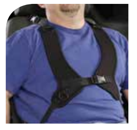
Posture vest and positioning belt