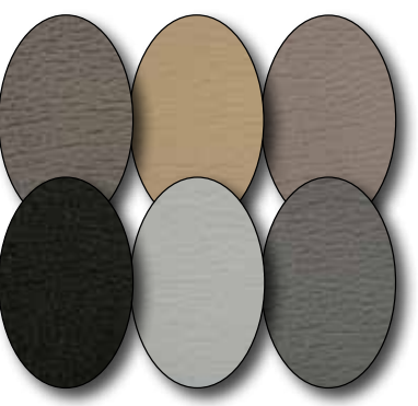
See material swatches for accurate color representation.