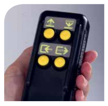
Exterior control pendant. (Only on 6000 model)