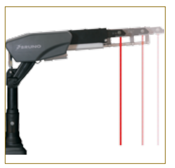
Telescoping version. (VSL 6900)