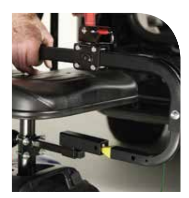
Custom docking devices.