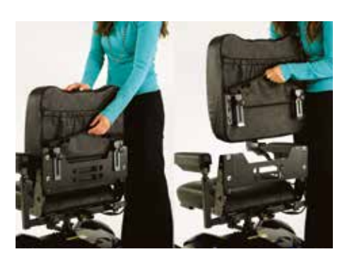
Back-Off easily removes back of mobility device to fit into shorter vehicle openings.