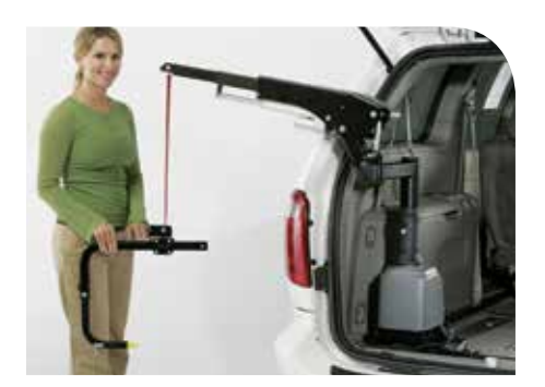
Driver side placement.